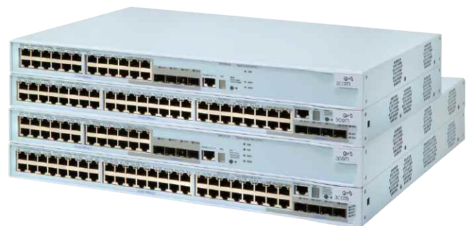
from top: 3Com Switch 4500G 24-Port, Switch 4500G 48-Port, Switch 4500G PWR 24-Port, Switch 4500G PWR 48-Port

These switches come with a limited lifetime warranty covering the unit, power supply and fan. Also provided is Advanced Hardware Replacement, with next business day shipment available in most regions.